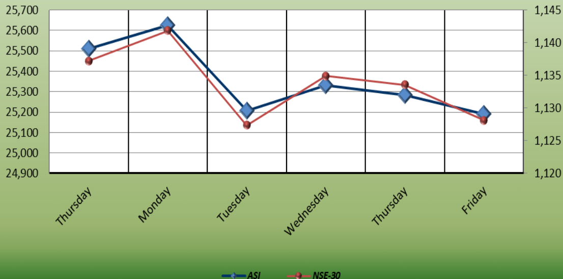
The NSE All-Share and NSE-30 Indices Week Ended April 21st, 2017