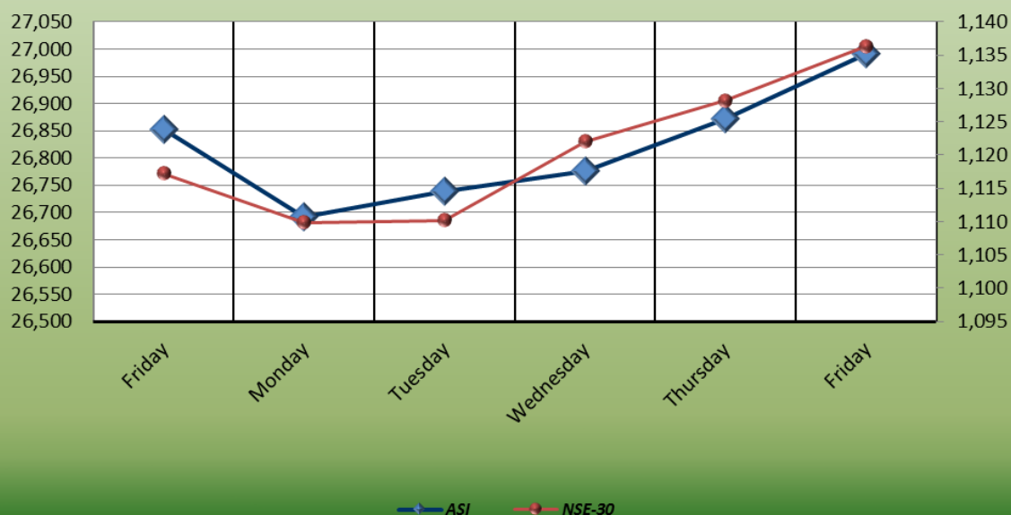
The NSE All-Share and NSE-30 Indices Week Ended November 22nd 2019