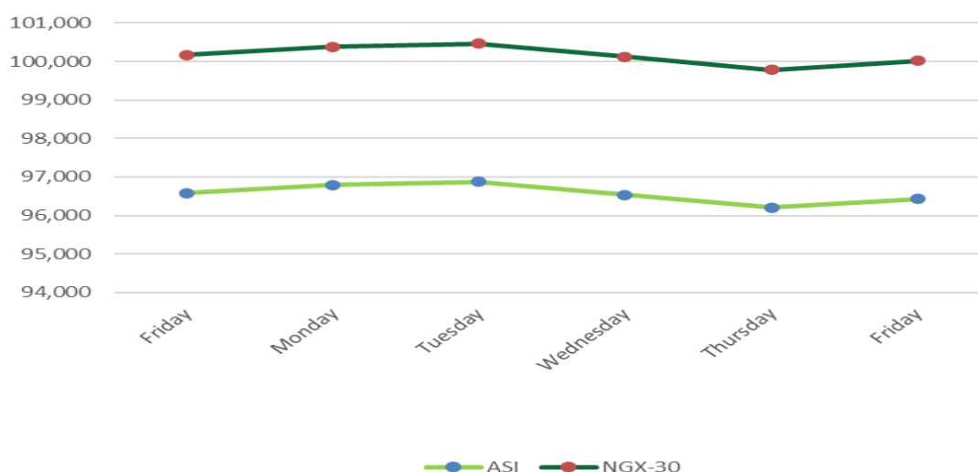
The NGX All-Share and NGX-30 Indices Week Ended September 06, 2024