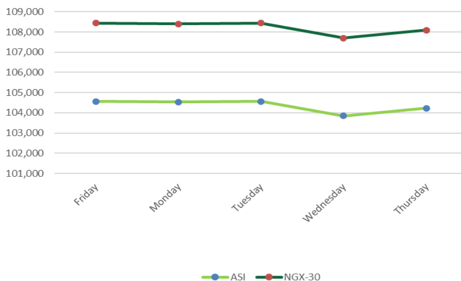
The NGX All-Share and NGX-30 Indices Week Ended April 17, 2025